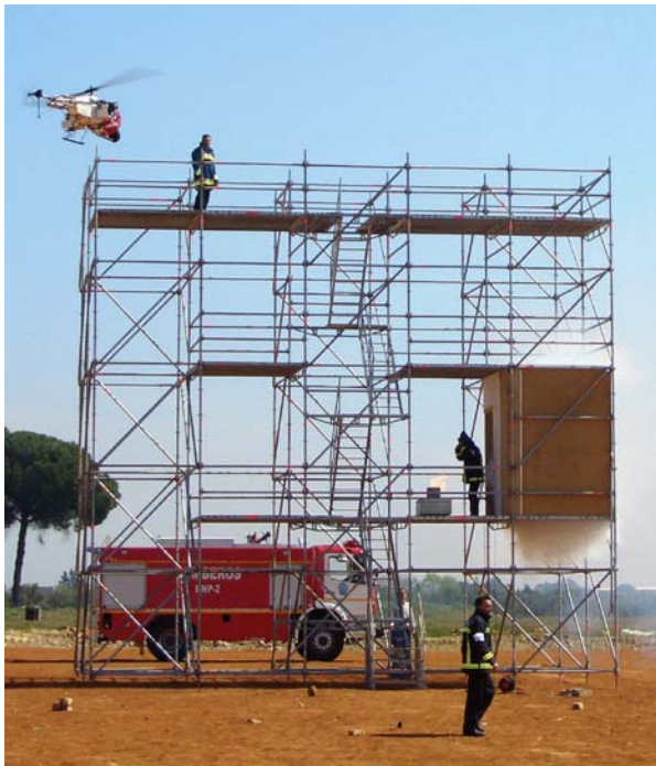
Figure 4: AWARE experiment

Examples of European projects, where current members of NES have worked on, are the Embedded WiSeNts coordination action and the research projects AWARE and EMMA. The goal of the Embedded WiSeNts coordination action was to formulate a common vision as well as a roadmap towards wireless sensor networks and cooperating embedded systems. In AWARE, the capabilities of UAVs, robots, cameras and sensor networks were combined to fight the spread of fire in indoor scenarios (see Figure 4). The members of NES were responsible for the design and implementation of a publish/subscribe middleware that allows for the seamless communication of entities in the system. The goal of the EMMA project was the development of a novel communication middleware for wireless cooperating objects in automotive applications.