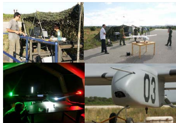
Figure 3: Air operations

Ota Air Base from the Portuguese Air Force. These were part of experiments carried out under the Pitvant project, a major collaborative effort between the Portuguese Air Force Academy and Porto University. In 2009 we accumulated over 100 autonomous flights with 6 different UAV platforms. In 2010 we have already performed night operations at the Sintra Air Force base. In 2010 new operations are already planned with additional developments to be tested and certified. These missions include control hand-over between operators, target tracking and vision based control. Again, we have been using, and developing, our software toolchain for command and control with mixed initiative interactions.