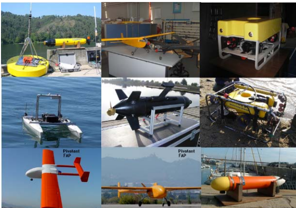
Figure 1: LSTS unmanned vehicles

Currently, the LSTS fleet includes two remotely operated submarines (rated for 200m and equipped with video cameras and side-scan sonar), two autonomous underwater vehicles (1.8m long, equipped with side-scan sonar, acoustic modem and ADCP), six Light autonomous underwater vehicles (1.5m long, which can be configured with CTD sensor, side-scan sonar and acoustic modem), one autonomous surface vehicle (can be used as a communications gateway for wireless and underwater communications), six autonomous air vehicles (wingspans ranging from 1.8m to 3.6m), gateway buoys (supporting wireless and underwater communications) and sixty Telos Motes with several sensor configurations.