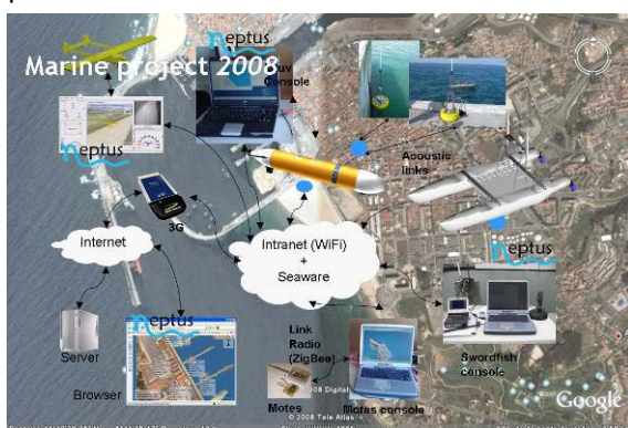
Figure 2: Deployment with aquatic vehicles 1

The fleet of the LSTS has seen action at least twice a month since 2007. We have been operating aquatic vehicles in the Atlantic and Pacific oceans and also in Portuguese and American rivers. Figure 2 depicts a representation of the setup for a demonstration which took place in 2008 at the Porto harbor in Portugal. In this demonstration we operated several autonomous underwater and surface vehicles under the control of our software toolchain operating over inter-operated communication networks.