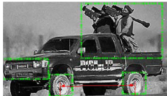
A Technical vehicle, classified by GCS algorithms

The SELEX Galileo Synthetic Environment facilitated hardware in-the-loop concept evaluations prior to full system implementation. This permitted simulated trials in a safe controlled environment at a fraction of the cost and set-up time of real trials.